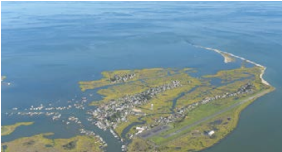
Tangier Island.