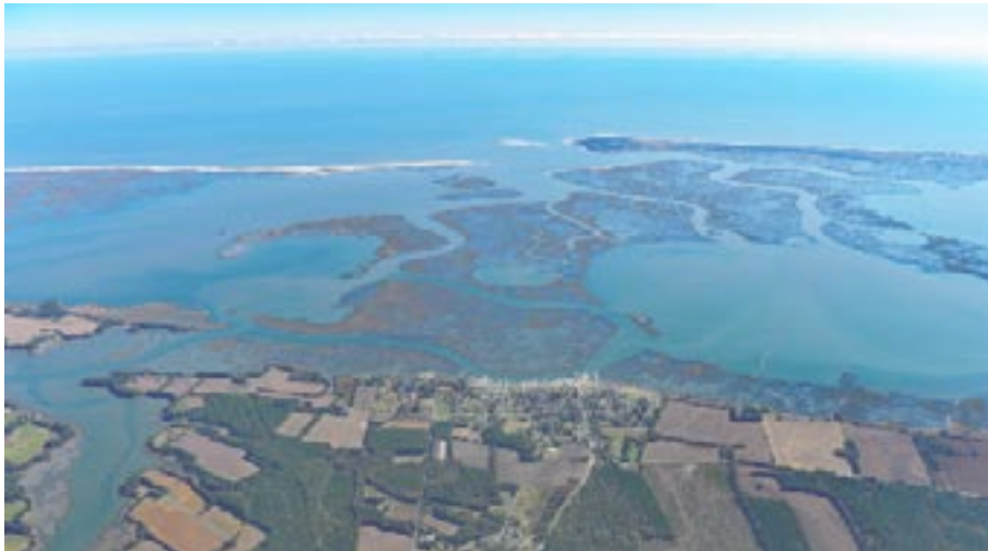
Wachapreague.