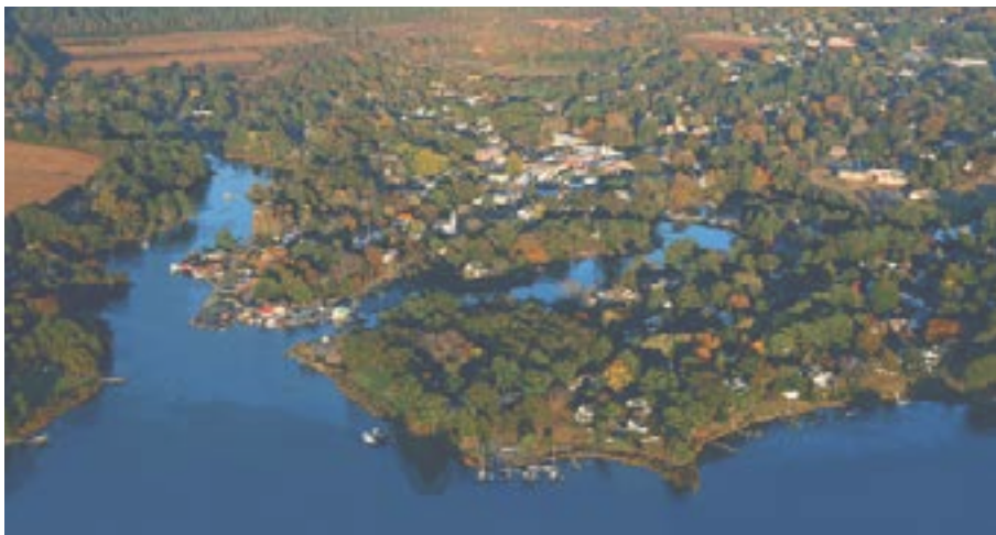
Onancock.